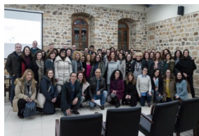
Photos from the workshop.