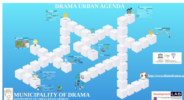
Drama Urban Agenda presentation scheme.