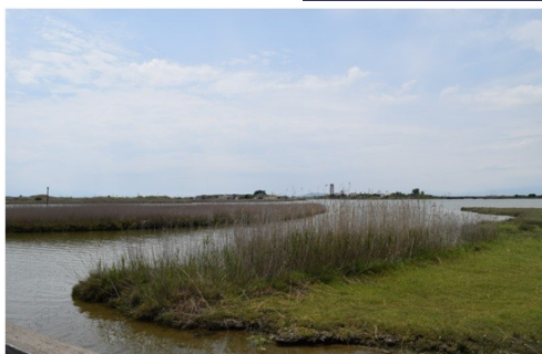
Avdera Riparian Area, Xanthi, Greece.