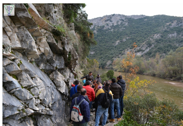
Ecotourism activities involve nature walks in the riparian areas.